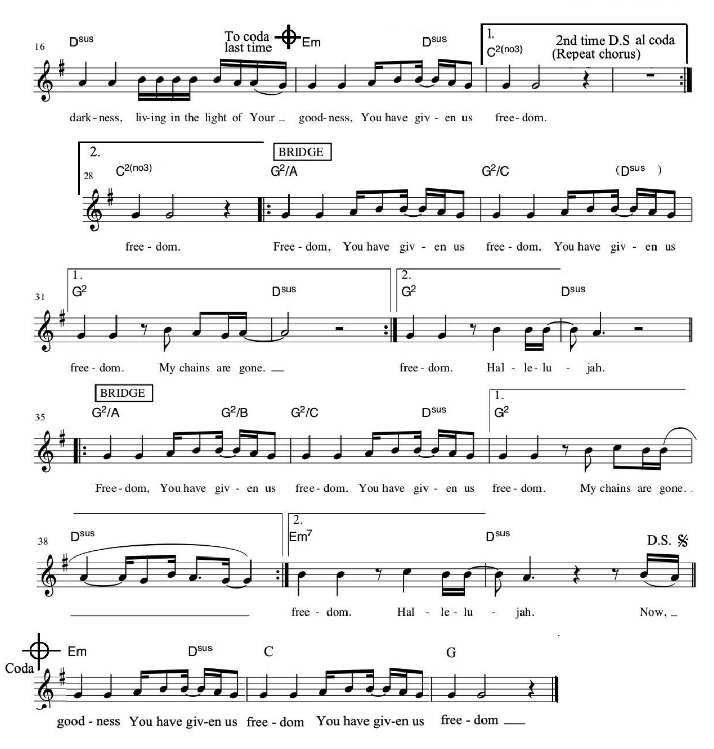
Resurrection Power - 2